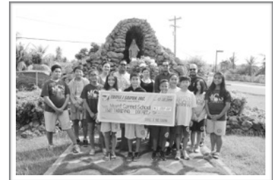
Triple J Group of Companies

Mount Carmel School thanks the following companies for making Education Tax Credit (ETC) contributions to the school.